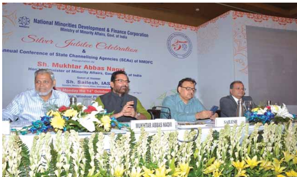
Inauguration of Silver Jubilee Celebrations & Annual Conference of State Channelizing Agencies (SCAs) of NMDFC by Hon'ble Minister of Minority Affairs, GOI at Hotel Le Meridien New Delhi on 14 th Oct., 2019