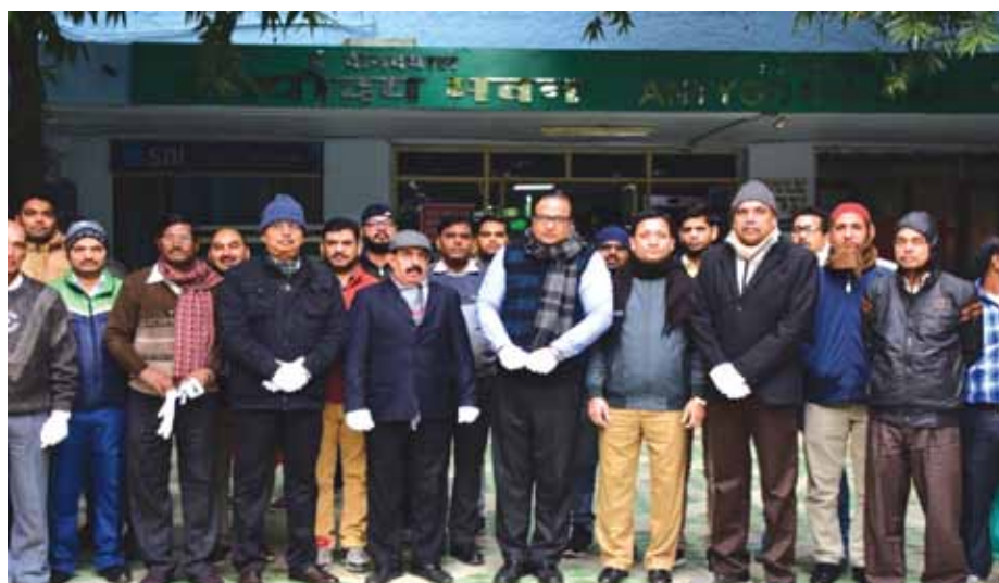
Inauguration of Swachhta Pakhwada -2019