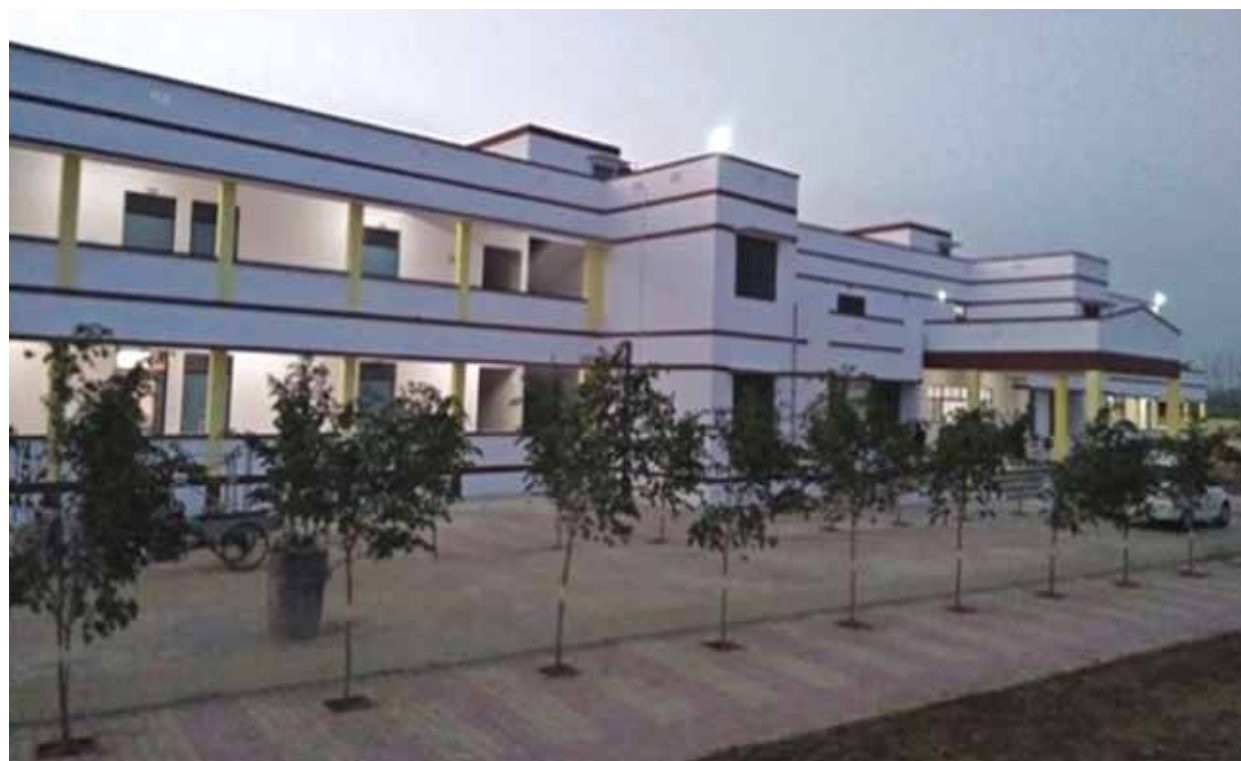
Government Inter College, Jasaura MCA :- Kharkhuda, Distt :- Meerut, Uttar Pradesh