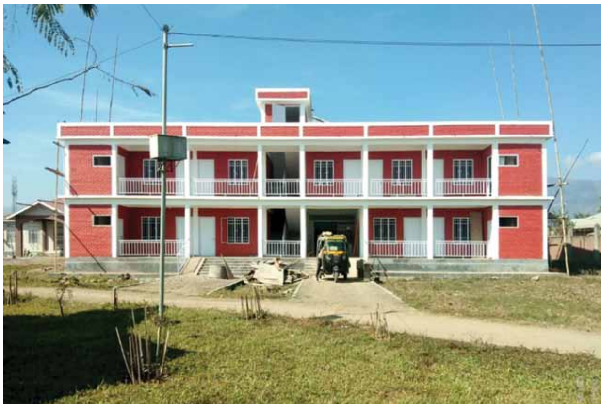
Sadhbav Mandap at Churachandpur TD Block, Manipur