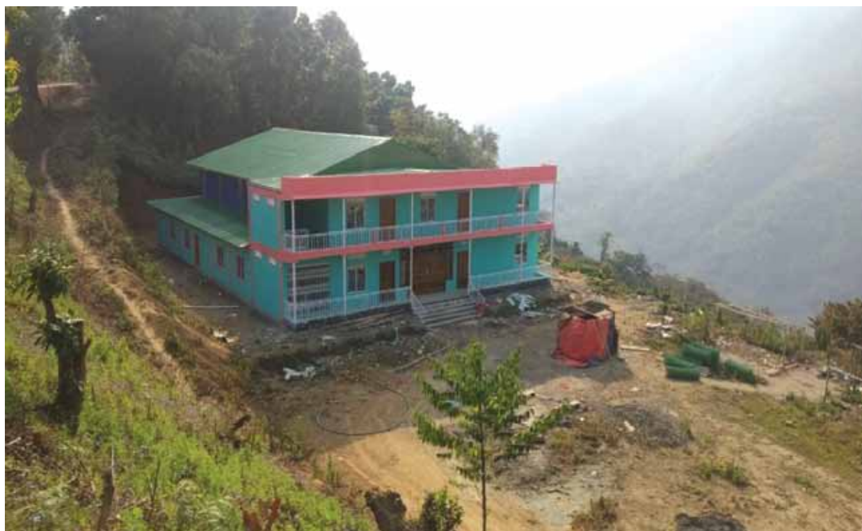
Sadhbav Mandap at Tamei TD Block, Tamenglong, Manipur