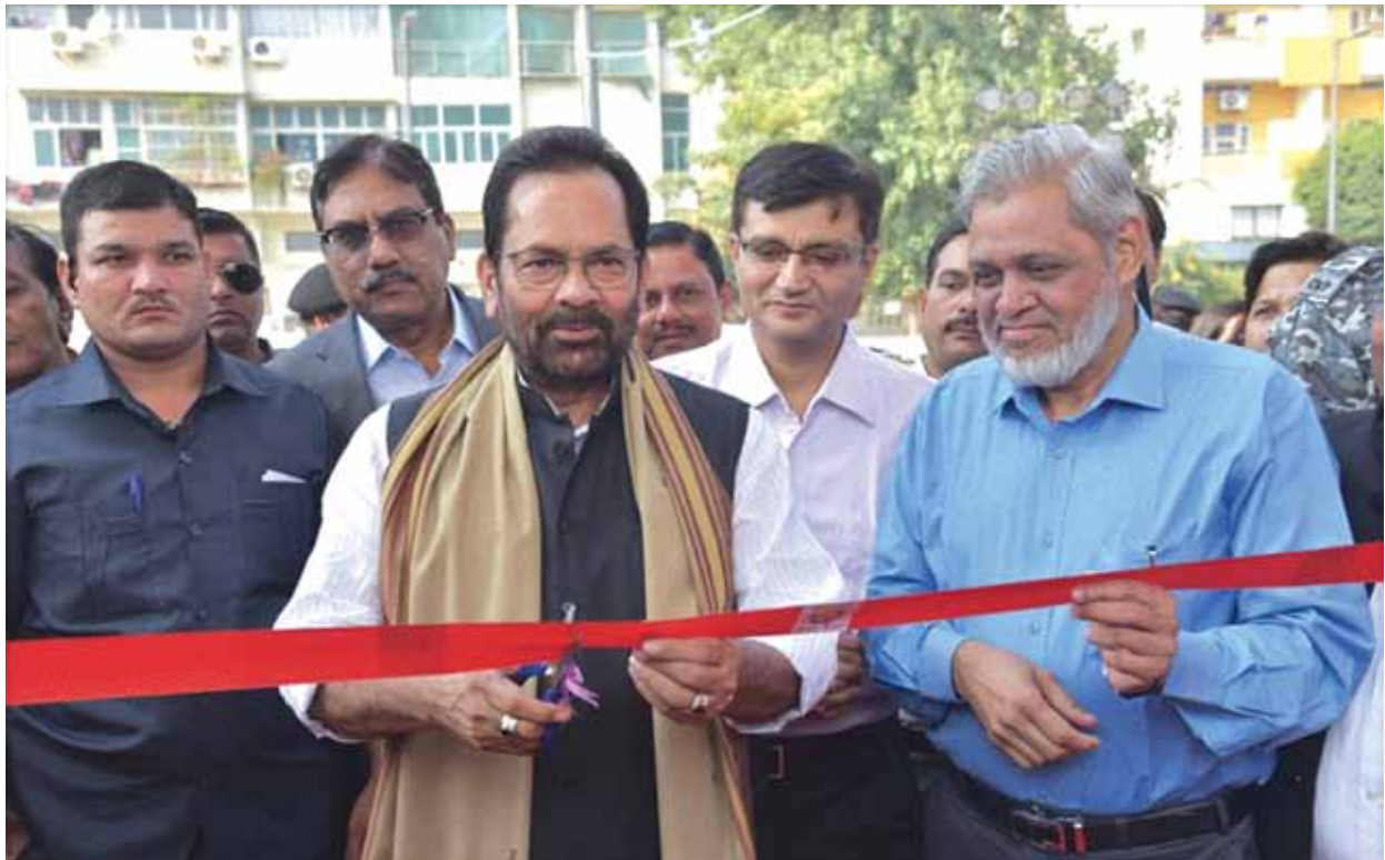
Hon'ble Minister of Minority Affairs Shri Mukhtar Abbas Naqvi inaugurated Hunar Haat at Ahmedabad, Gujarat