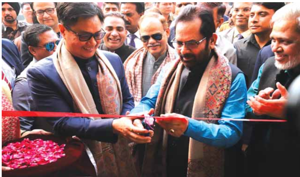
Hon'ble Minister of Minority Affairs Shri Mukhtar Abbas Naqvi inaugurated Hunar Haat at IITF, Pragati Maidan, New Delhi.