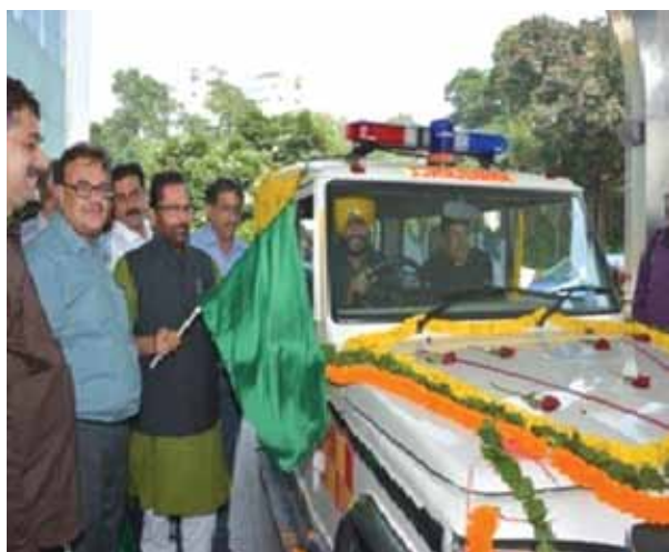
Hon'ble Minister of Minority Affairs flagged off Ambulance to Shaheed Bhagat Singh Sewa Dal during Silver Jubilee Celebrations & Annual Conference of State Channelizing Agencies (SCAs) of NMDFC organized at Hotel Le Meridien New Delhi on 14 th Oct., 2019

NMDFC is implementing its CSR programme for welfare of persons from Minority Clusters by extending facilities for Education, Healthcare, Drinking water, Sanitation, etc. Funds under CSR program is allocated based on 2% average surplus generated by NMDFC for the last three years. During period from 1.4.2019 to 31.12.2019, NMDFC has sanctioned various projects under its CSR program. Some of them include Computer Centre for the poor students of two Madrasas cum Schools in aspirational district of Jaisalmer, providing Ambulance to Shaheed Bhagat Singh Sewa Dal for extending Free Emergency Services in Delhi to poor and needy people.