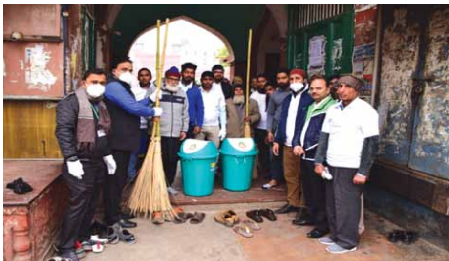
Donation of Cleaning logistic at Fatehpuri Masjid, Old Delhi