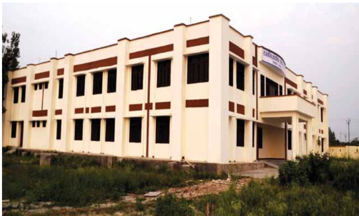
Government Industrial Training Institute MCA :- Kharkhuda, Distt :- Meerut, Uttar Pradesh