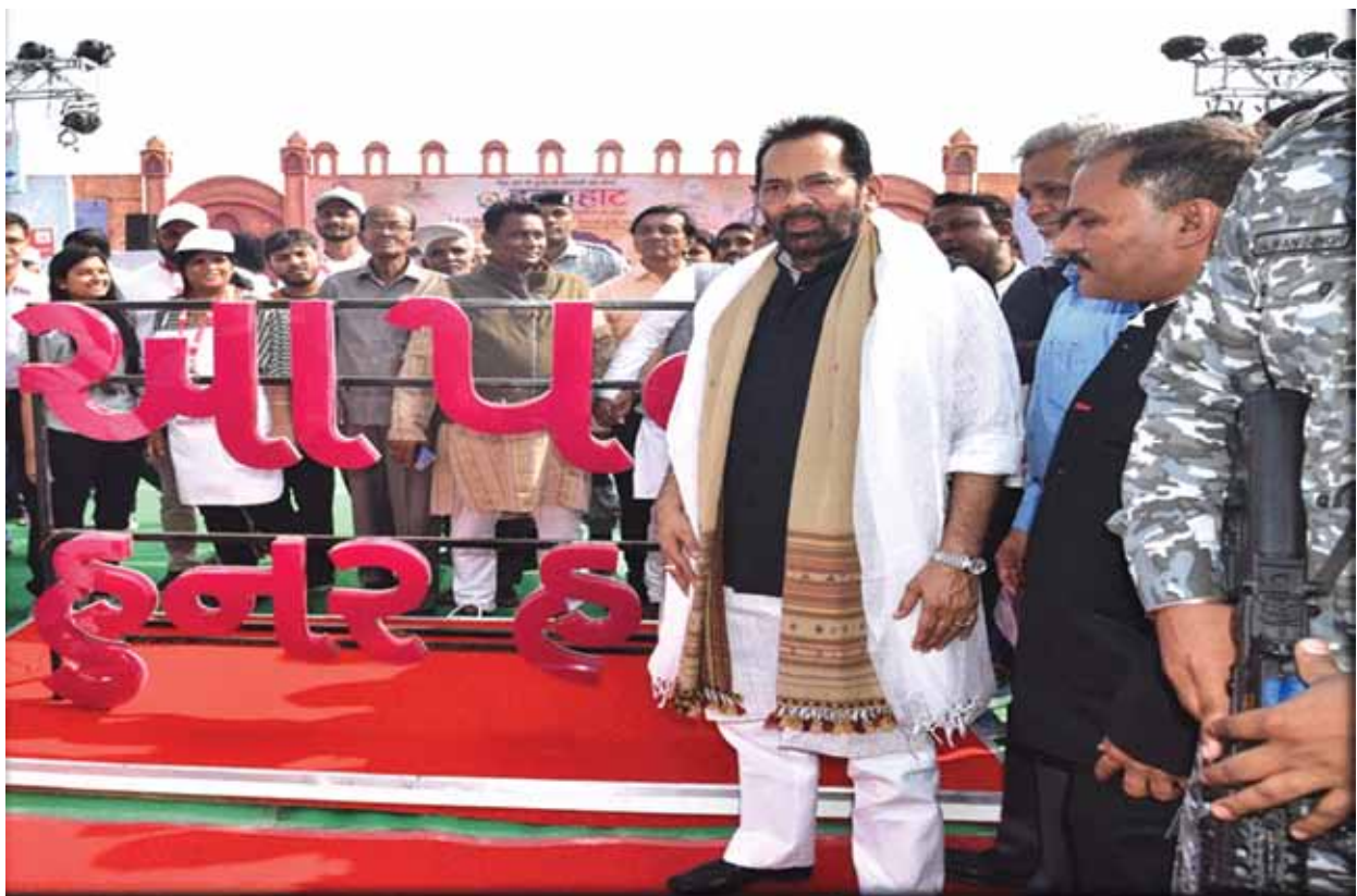
Hon'ble Minister of Minority Affairs Shri Mukhtar Abbas Naqvi at Hunar Haat, Ahmedabad, Gujarat