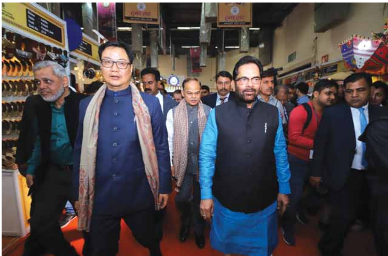
Hon'ble Minister of Minority Affairs Shri Mukhtar Abbas Naqvi and Shri Kiren Rijju, Hon'ble Minister of State for Minority Affairs visiting Hunar Haat at IITF, Pragati Maidan, New Delhi.