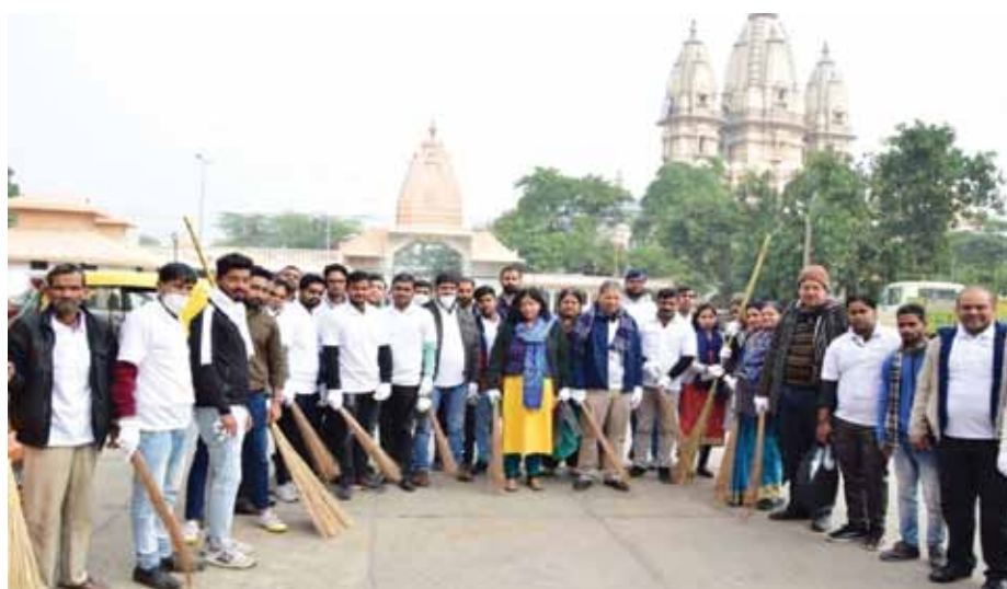
Cleaning Activity undertaken by MoMA at Chhaterpur Mandir.