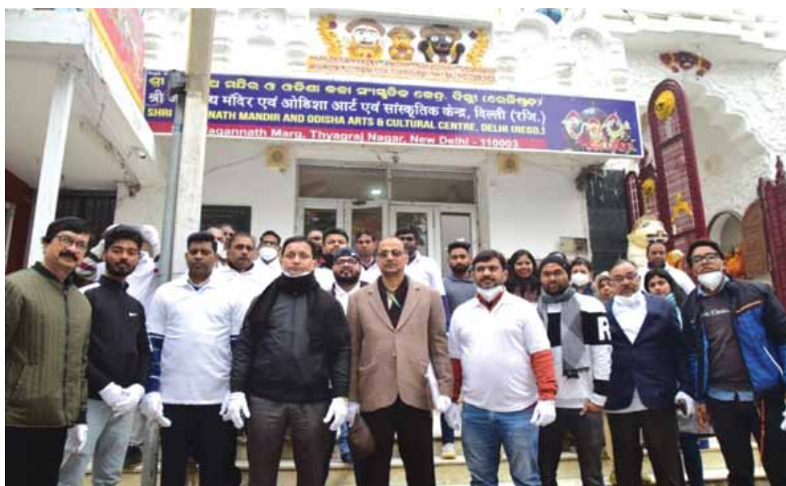
Cleaning Activity undertaken by MoMA at Shri Jagannath Mandir.