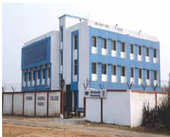
Nursing Hospital in Chanhon MCA:- Ranchi, Distt:- Ranchi, Jharkhand