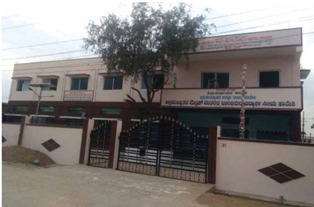
Post Metric Girls Hostel, Haveri Town, Haveri District, Karnataka