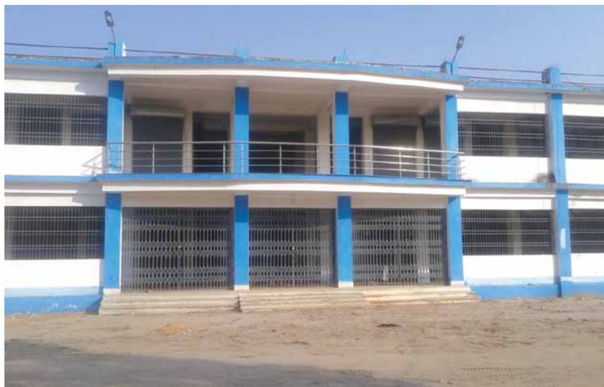
Market Shed/Haat Shed MCA :- Kaliganj, Distt : Nadia, West Bengal