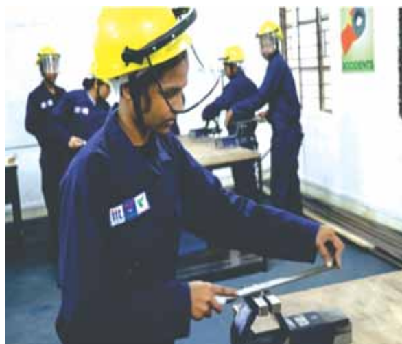
Industrial Training Institute, Ranchi MCA :- Ranchi, Distt :- Ranchi, Jharkhand