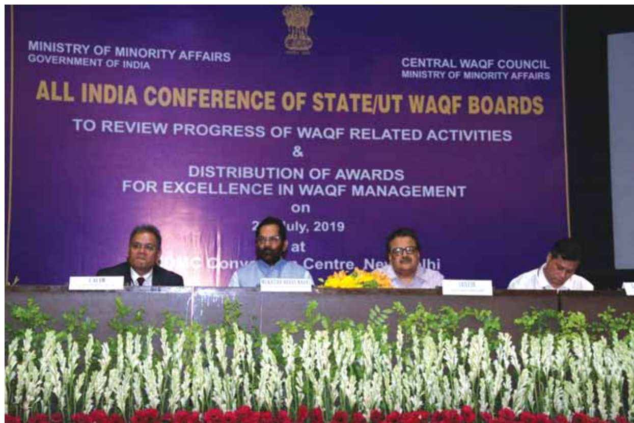
Natioanl Waqf conference organised at New Delhi on 29.07.2019 under the chairmanship of Hon'ble Minister for Minority Affairs Shri Mukhtar Abbas Naqvi.

Statutory Audit and Supplementary Audit of the company for the financial year 2018-2019 had been conducted timely and Nil Comments were issued by the Comptroller and Auditor General of India (CAG). Accordingly, balance sheet of the company was published on time. The accounts of the company for the financial year 2018-2019 and appointment of statutory auditors for the financial year 2019-2020 were approved by the shareholders in the sixth (6th) AGM of the company held on 30/10/2019.