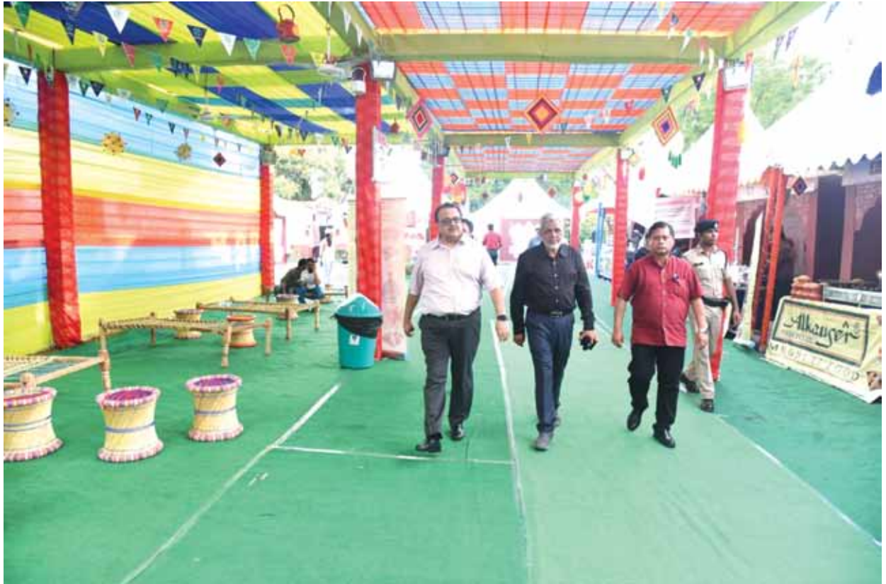
Secretary ( Minority Affairs), Additional Secretary (MA) and CMD(NMDFC) at Hunar Haat, Jaipur