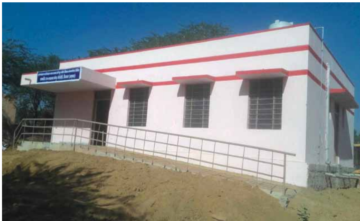
Sub-PHC, Gotoli MCA :- Tijara, Distt :- Alwar, Rajasthan