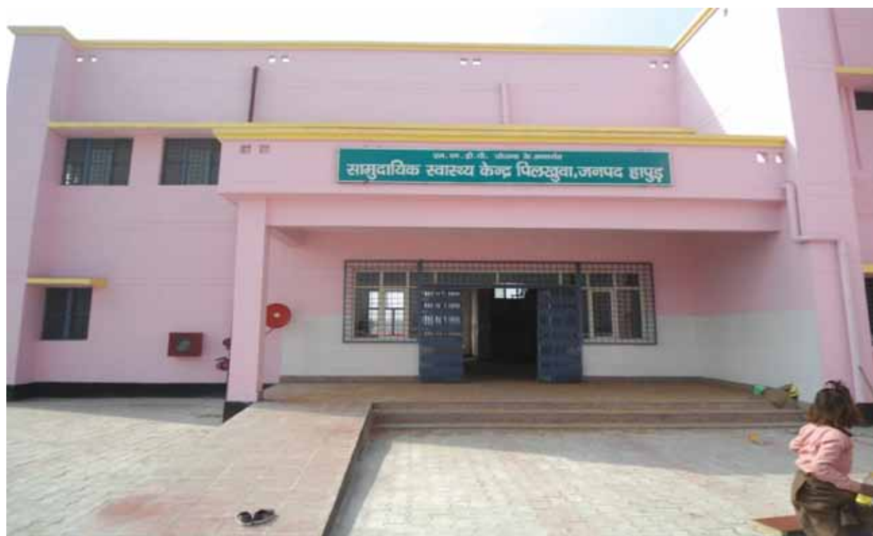
Community Health Centre, Pilkhuwa MCA :- Hapur, Distt : Hapur, Uttar Pradesh